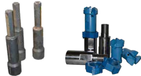
Left to right: Grout Fittings; Drill Bits & Adaptor; Drill Spanners