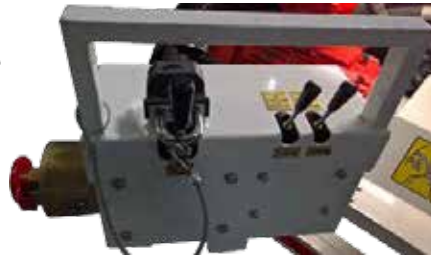
Tram Control with Valve Lock