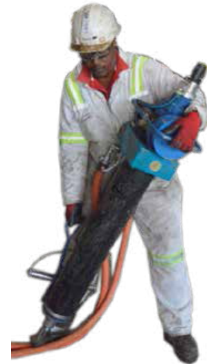
Refurbished Gopher being hand held