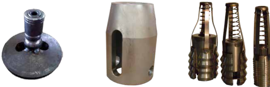
Left to right: 25T PLV Domeplate Barrel & Wedge; Nose Cone; Expansion Shell Assembly