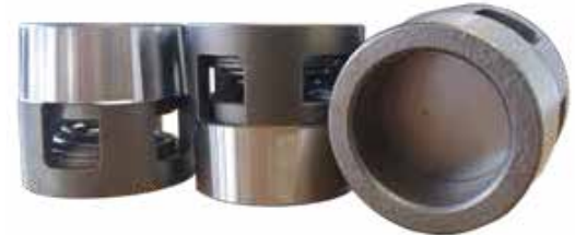
Disc and Spring Valve Assembly