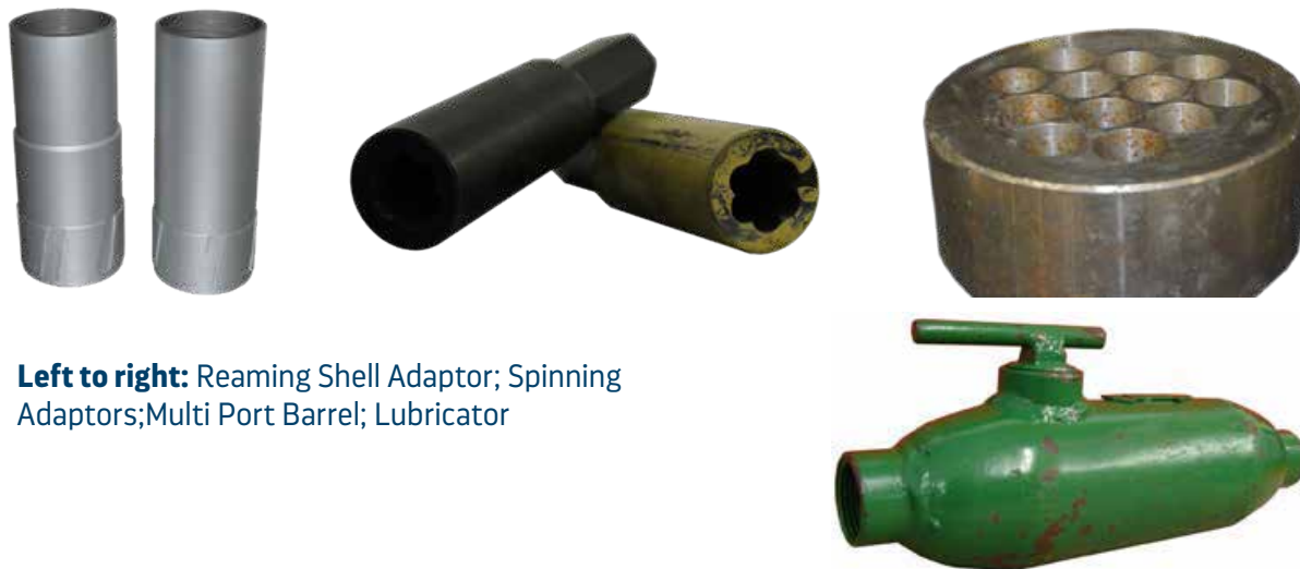
Left to right: Reaming Shell Adaptor; Spinning Adaptors; Multi Port Barrel; Lubricator