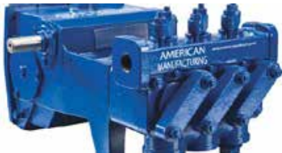
American AL0918B Piston Pump