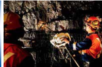
Cub Hand Held Borer