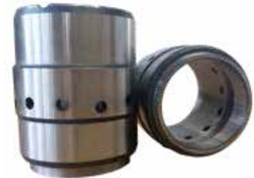
12 Hole Valve