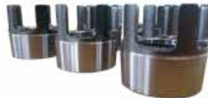
Ball Valve Seat