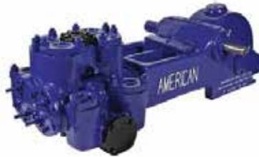
American 4.5" x 5" FF-AXFM

American Manufacturing Company is a quality manufacturer of new and replacement parts for the wide variety of mud pumps, centrifugal pumps, rig parts, and swivel parts found on the world market today. Highly trained staff use state-of-the-art equipment and proven quality control methods to produce the finest pump replacement parts found in the market today..