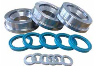
Top to bottom: Stop Rings, Water Box Seals & Washers