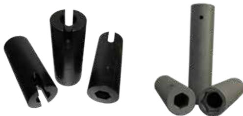
Left to right: Slotted Spinning Adaptors; Roofbolt Adaptors