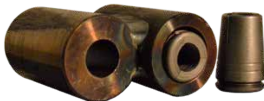
Left to right: 25T Double Barrel; Resin Bolt