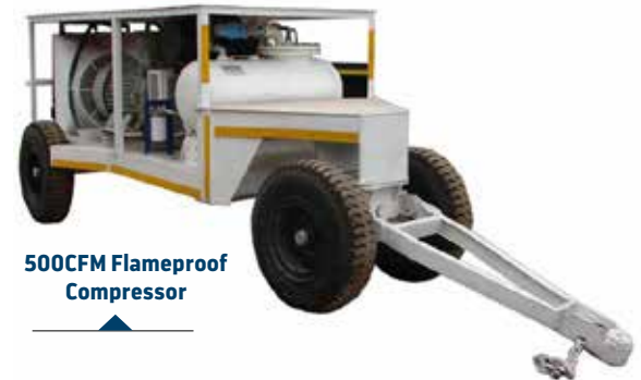
500CFM Flameproof Compressor

In addition to supporting the OEM range, Anaf has provided total rebuilds on other brands of equipment.