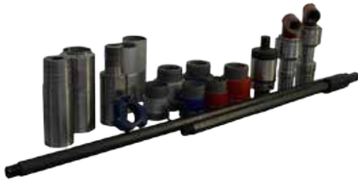
Water Swivels, Drill Rods, Core Drilling Drill Bits; Reaming Shell Adaptors